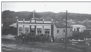
Te Kuiti Borough Council and Coronation Library 1912

Waitomo District Library was established in 1906 and celebrated its centenary in 2006. The Library is located at 28 Taupiri Street and has been located in this building for approximately 27 years.