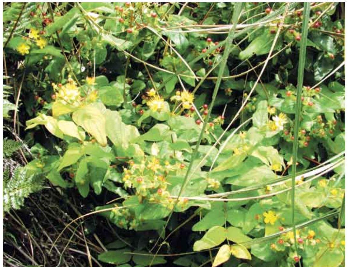
STOP THE SPREAD: Members of the Taumarunui Tutsan Action Group will be speaking at a meeting in Piopio on July 18 to educate local residents about the pest plant Tutsan (pictured) and how to prevent its invasion. This photograph was taken by Department of Conservation staff near the Kakaho Stream, Pureora Forest Park. PHOTO DEPARTMENT OF CONSERVATION