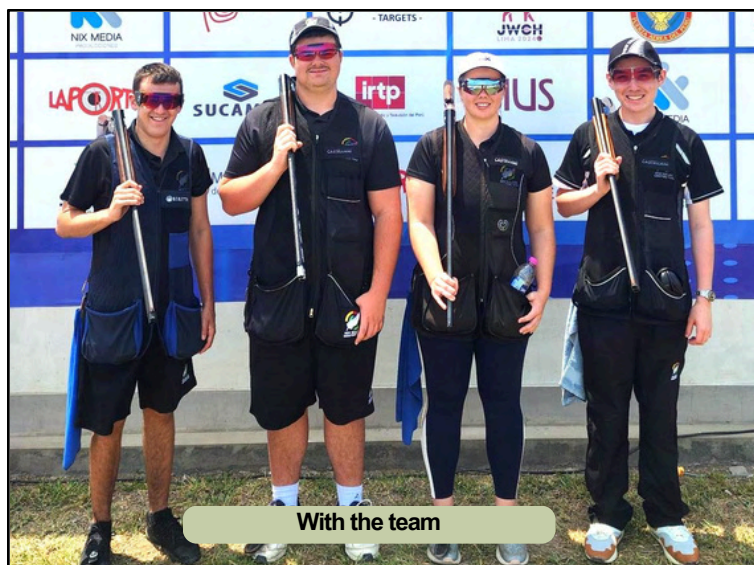
With the team