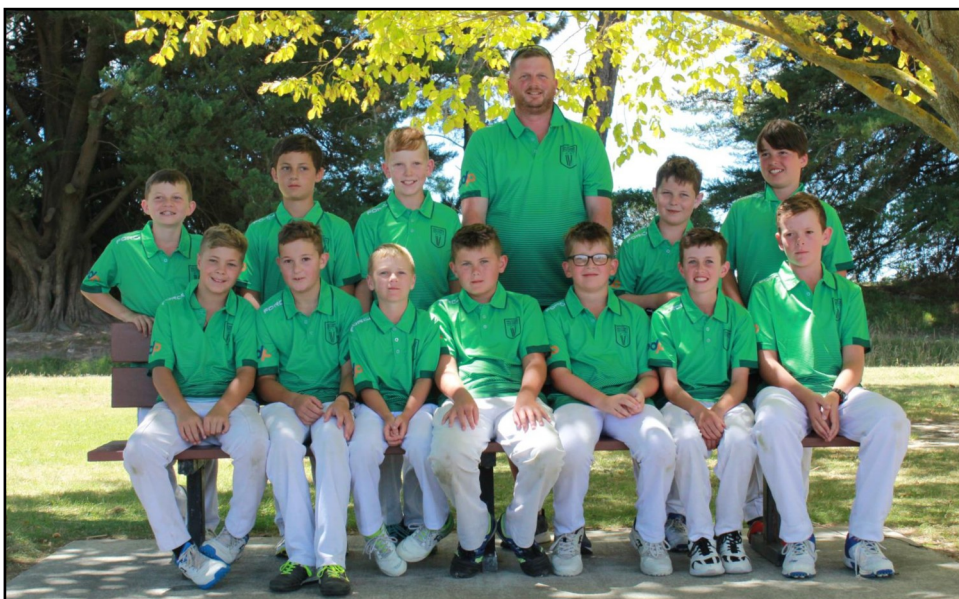
Waitomo Riverbend Camp 2021