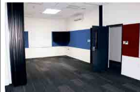
PLACE TO MEET: The Te Kuiti Community House which has several rooms to provide educational, social and recreational services to the community.

The public are welcome to attend both openings.