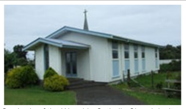
Our Lady of the Wayside Catholic Church invites the local community to support our children in their First Holy Communion Programme beginning on Saturday June 11<sup>th</sup> at the monthly Mass, 5pm.