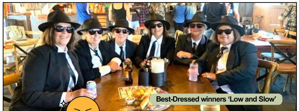
Best-Dressed winners 'Low and Slow'