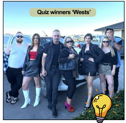
Quiz winners 'Wests'

The quiz night was a great success, and the Piopio College parent group would like to extend a heartfelt thank you to everyone who supported the event, as well as the amazing sponsors who made it all possible. Thanks to the hard work and dedication of the community, the students are one step closer to their dream adventure in Japan!