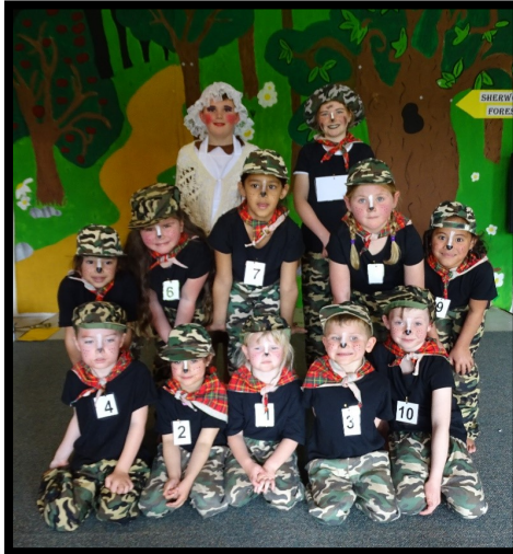
a goat being lead (dragged) around a ring on all fours!

Our students were amazing, coping with two late nights as well as two performance on two days that week. We were extremely grateful to our audiences for their compliance with mask wearing and social distancing etc.