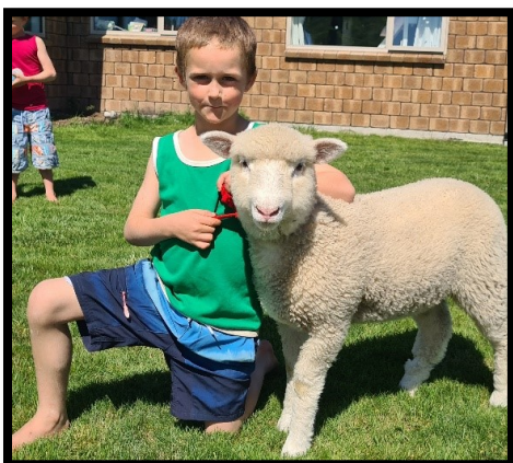
Well done to all our families for their participation, making it work and having so much fun with your kids!

Somewhere in the middle of all this chaos the staff shared a video of “How not to do it”. This involved staff dressed as a cow and