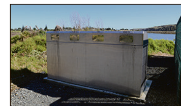
Public Recycling Station

Recycling facilities are also provided onsite and a Public Recycling Station is located next to the transfer station.