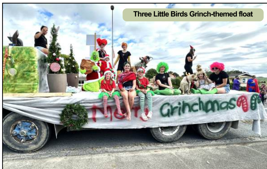
Three Little Birds Grinch-themed float

Also, a big shoutout to Jessie Loomans for winning the Piopio Christmas stocking raffle.