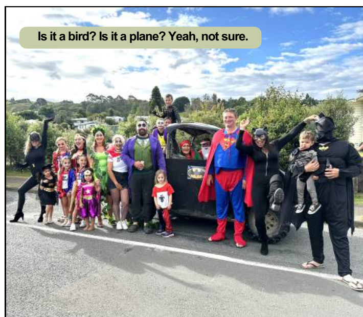
Is it a bird? Is it a plane? Yeah, not sure.