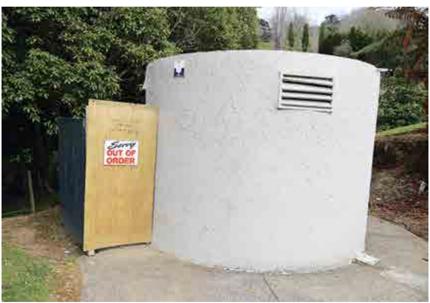
UNDER FIRE: Repairs to the public toilets at Te Kuiti's Brook Park are set to take place next month after they were deliberately set on fire in July.

"The Brook Park Incorporated Society and Waitomo District Council have been busy making improvements in an effort to encourage people to visit this location," he says.