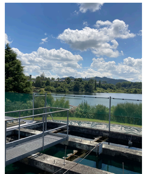
Karapiro Water Treatment Plant

While a number of opportunities for upgrades or further condition assessments have been identified, it's been reassuring to see that most of this work had already been noted by councils, and in many cases is either underway or planned. Anything not already captured will be incorporated into our work programme and longer-term planning.