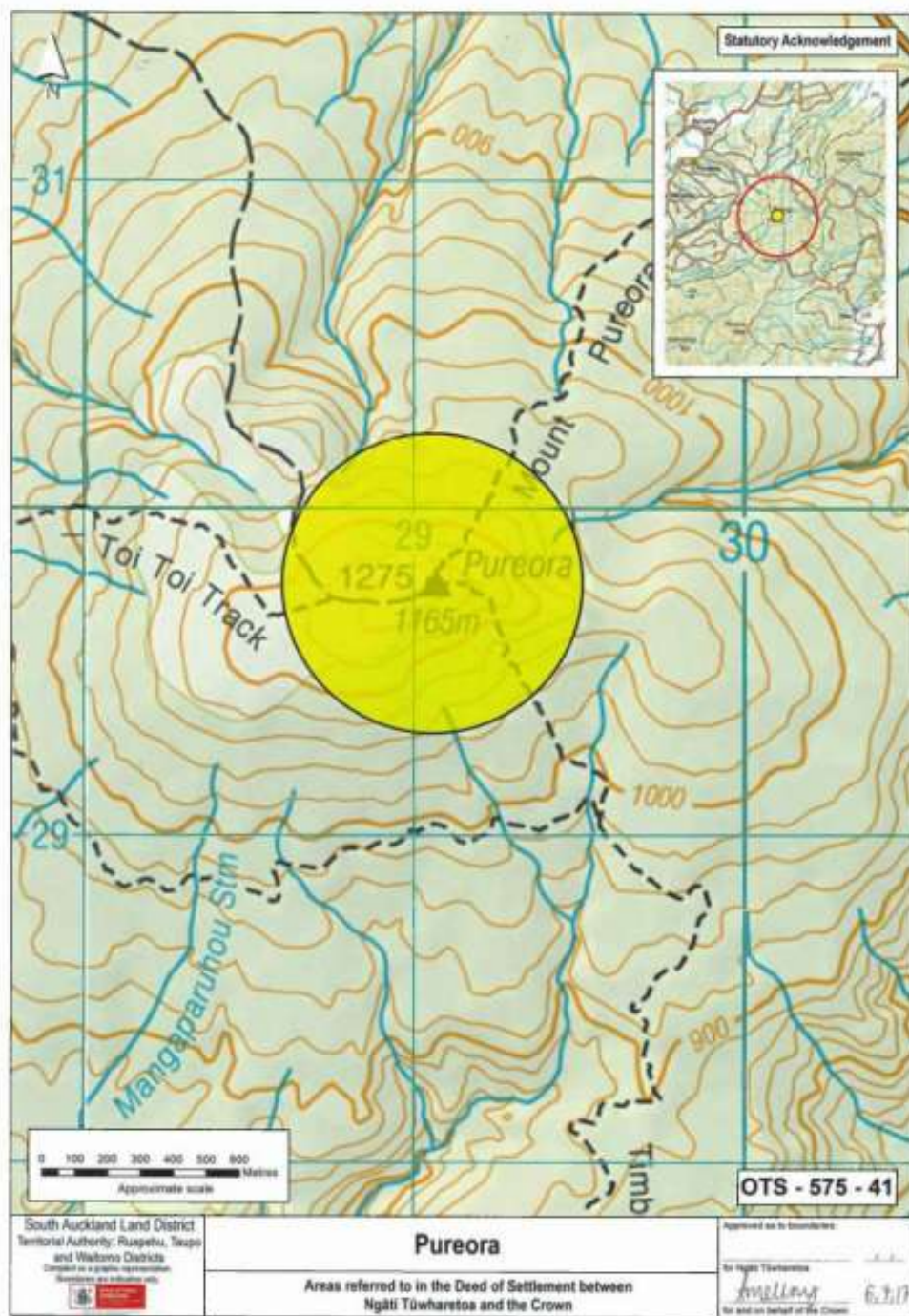
Ngāti Tuwharetoa - Pureora (OTS-575-41)