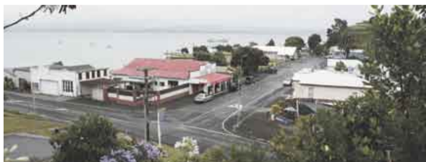
ON THE CASE: Public support is helping police track down offenders involved in a pack assault on Constable Perry Griffin in Kawhia (pictured above) on January 11.

"We're looking to market our district as best we can within a limited budget and we've got to use every tool we can to make tourists take note."