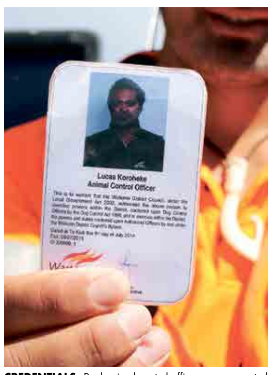
CREDENTIALS: Real animal control officers are warranted and carry official identification – make sure you ask to see it.