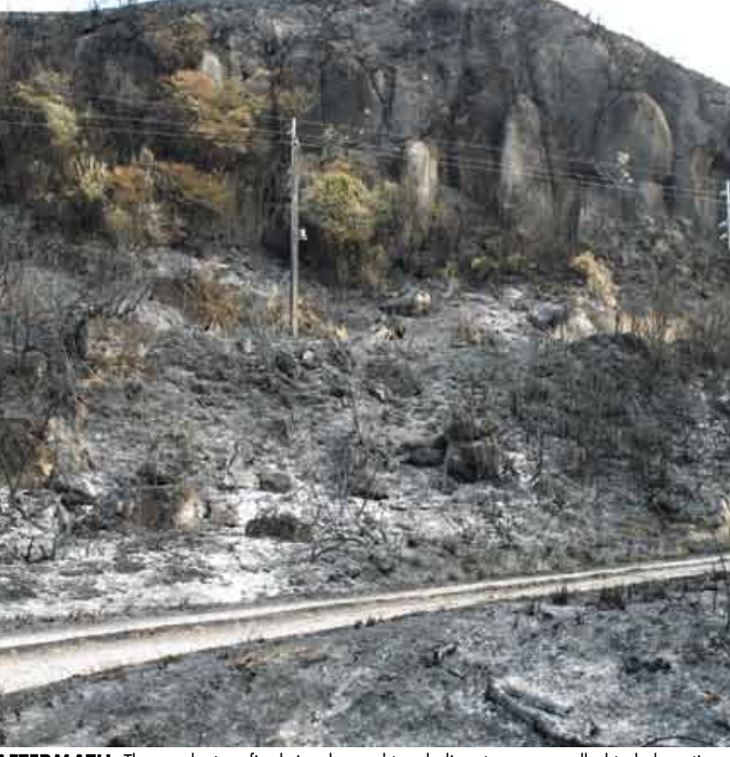
AFTERMATH: Three volunteer fire brigades and two helicopters were called to help extinguish a scrub fire on SH30 near Mangaokewa Rd, north of Kopaki last Thursday. The fire burnt more than 4ha of land (above & below) and took five hours to bring under control.

A KiwiRail spokeswoman says the line was